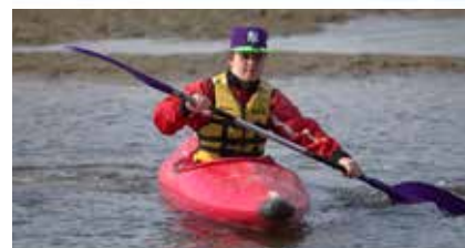
Photos from the annual Stage 2 PE three day Kayaking Practical at Port Noarlunga Aquatics.